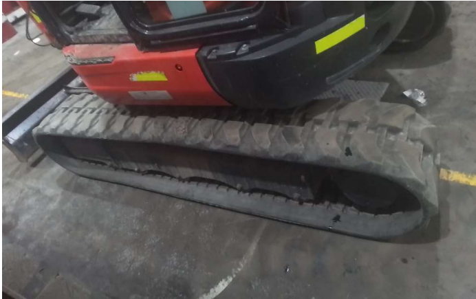
Tyre Condition 4

Australian Hammer Supplies Hire Unit 3/32 Williamson Road Ingleburn NSW 2565